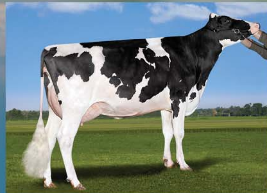
Dihana WILDTING Evy (GP-84 2yr) MGS: Spirtie