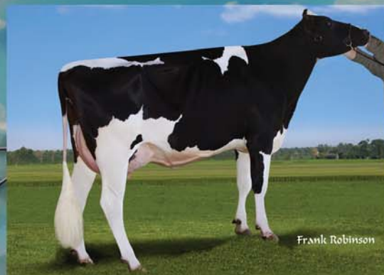
Swissess WILLROCK Paulex (VG-85 2yr) 2nd Sr 2yr Bedford 2011 MGS: Primettime