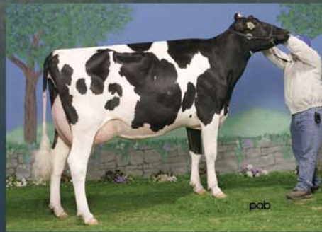
Dam: Gillette Blitz 2nd Wind (VG-88 27*) Also dam of #1 Type Bull Windhammer