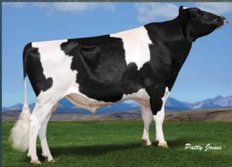
Gillette WILDTHING (EX-EXTRA) 250H00903 CANM7816547 aAa 531