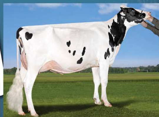
Donnelly WILD Rose (VG-85 2yr) MGS: Witness