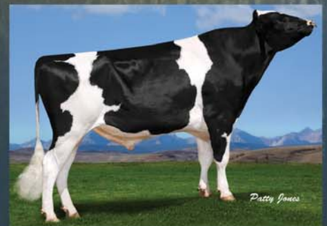
Gillette WILLROCK (EX-EXTRA) 250H00902 CANM7816548 aAa 234